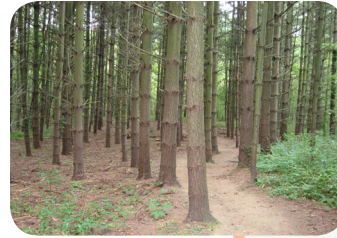
white pine grove